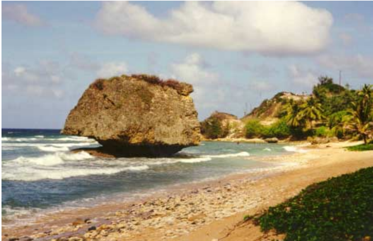
Plate: 1 Sea Rock on the East Coast, Bathsheba (National Park Area), (photo: ESPU)