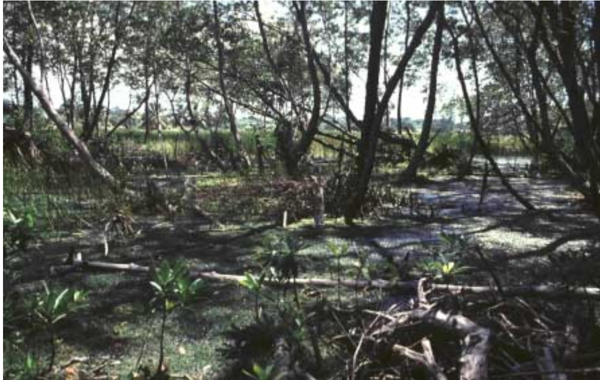
Plate: 3 The Graeme Hall Swamp white mangrove forest