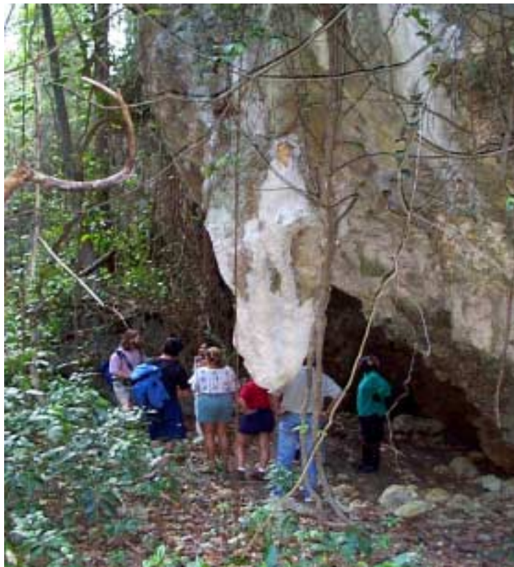
Plate: 15 Members of a tour group appreciating the natural features in the Jack in the Box gully