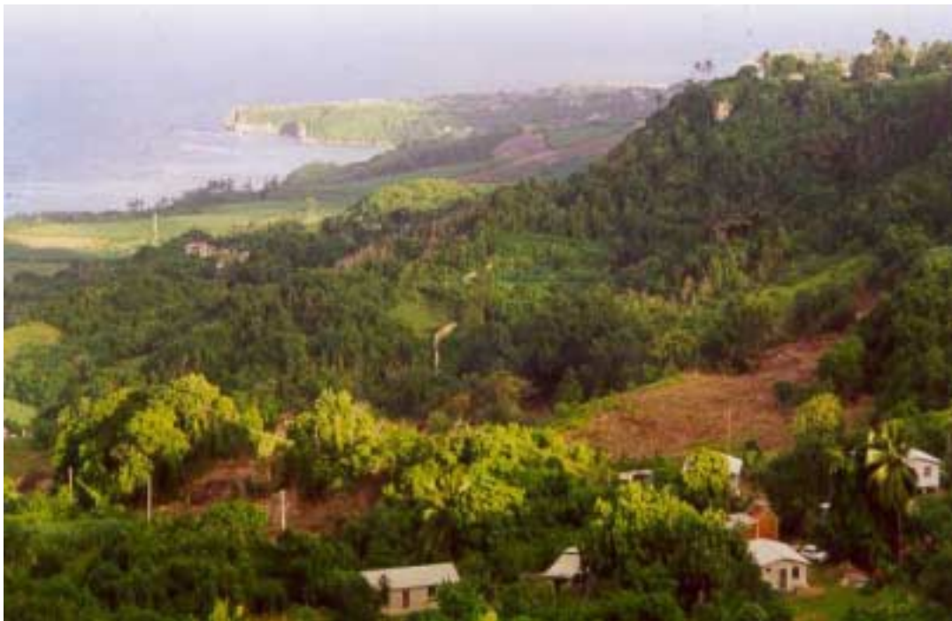
Plate: 14 A section of the National Park Area with East Coast in the background

Within the National Park Area only activities related to agriculture, conservation, forestry, passive recreation and facilities related to the National Park will be permitted. The NPDP details a set of policies to guide land use in this area.