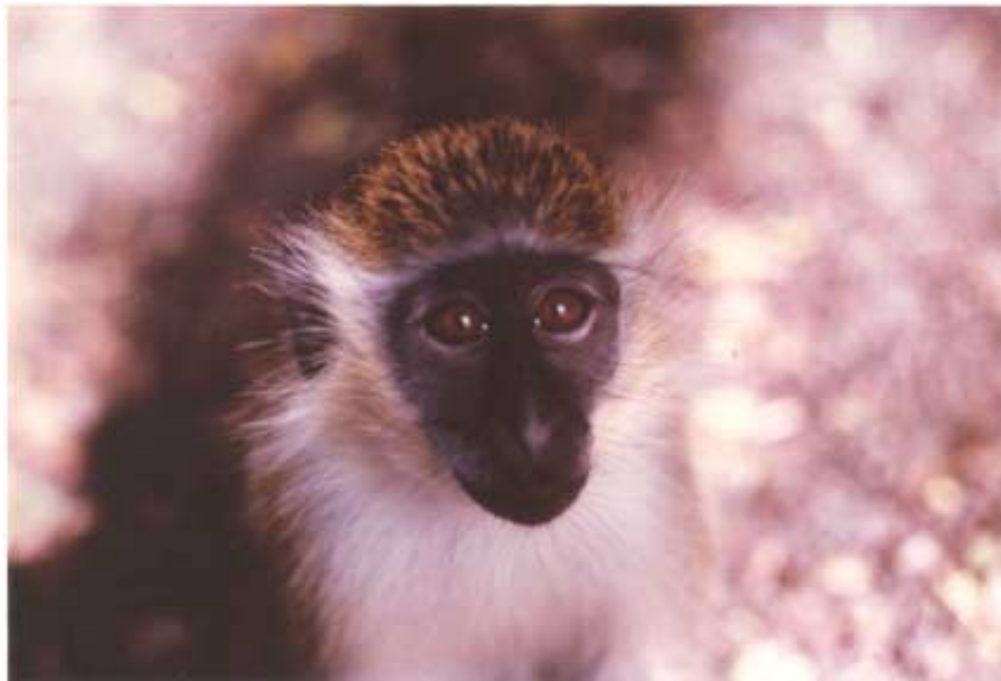
Plate: 7 The green monkey ( Cercopithecus aethiops sabaesus )