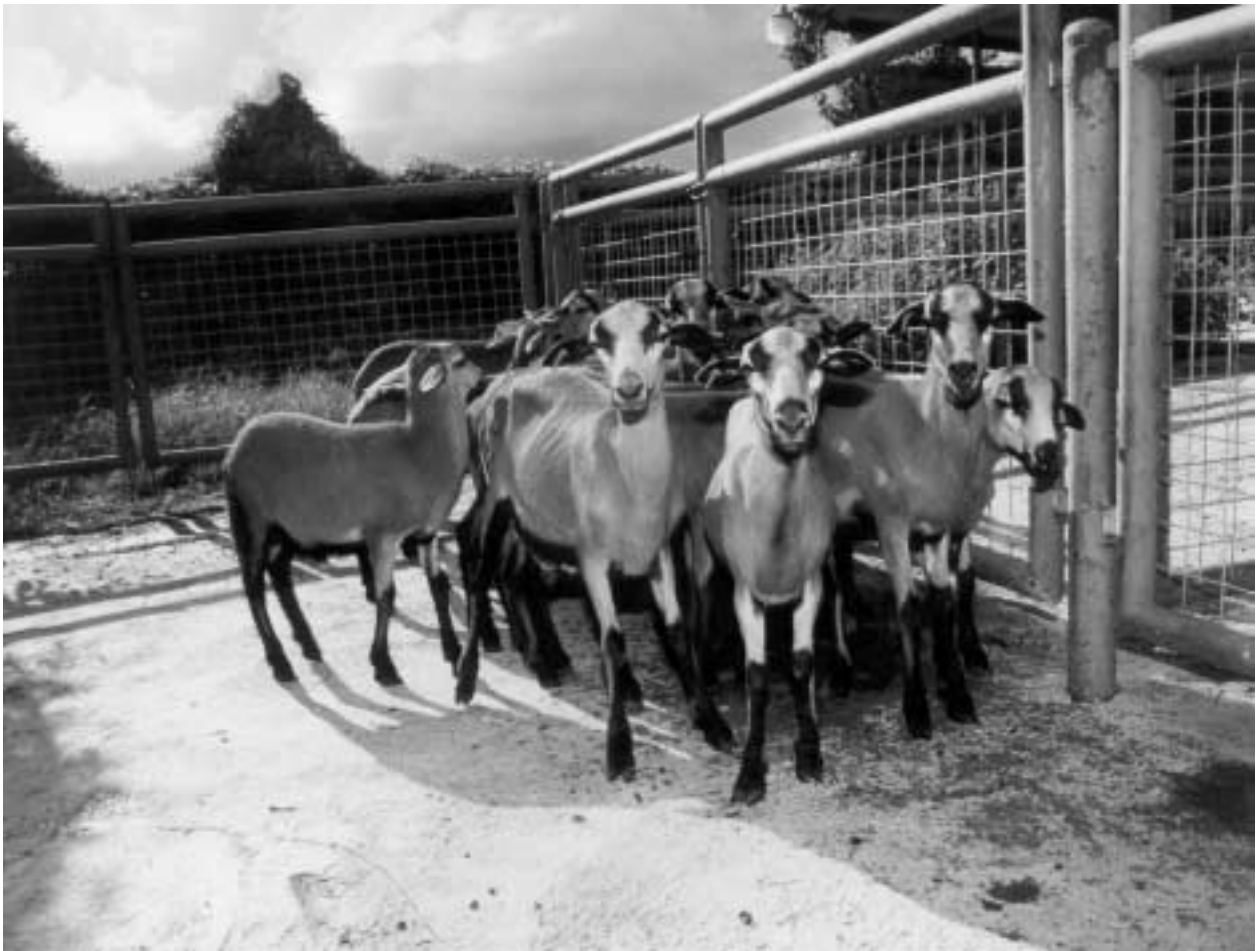
Plate: 5 Barbados black belly sheep

the genetic base of the breed is improved by selecting female and male lambs based on their performance during a 120-day observation period starting directly after birth. The only Government owned farm rearing the black belly sheep is the Greenland Agricultural Livestock Research Station in Greenland, St. Andrew, which is under the MAR. However there are many private farms and privately owned sheep scattered throughout Barbados. Presently the MAR is in the process of patenting the DNA profile of the Barbados black belly sheep.