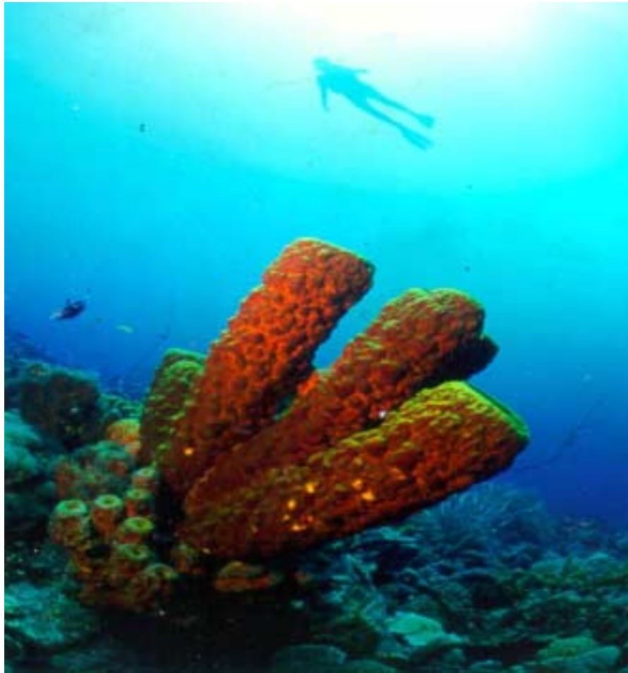
Plate: 11 Sponge on a Barbadian reef