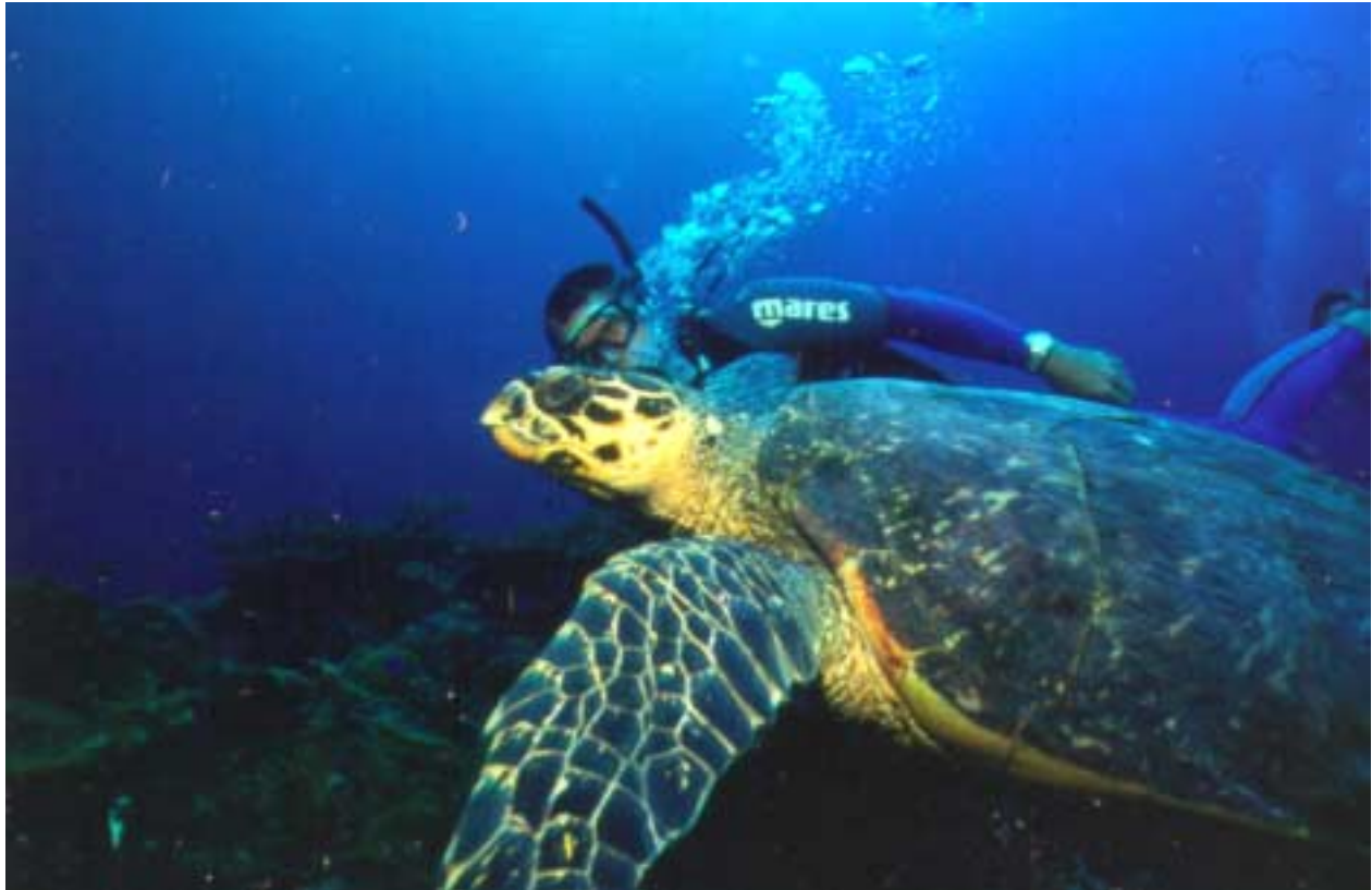
Plate: 9 A hawksbill turtle ( Eretmochelys imbricata ) being observed by a diver