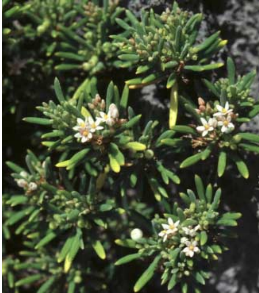
Plate: 4 A rare sea cliff species ( Strumpfia maritime )