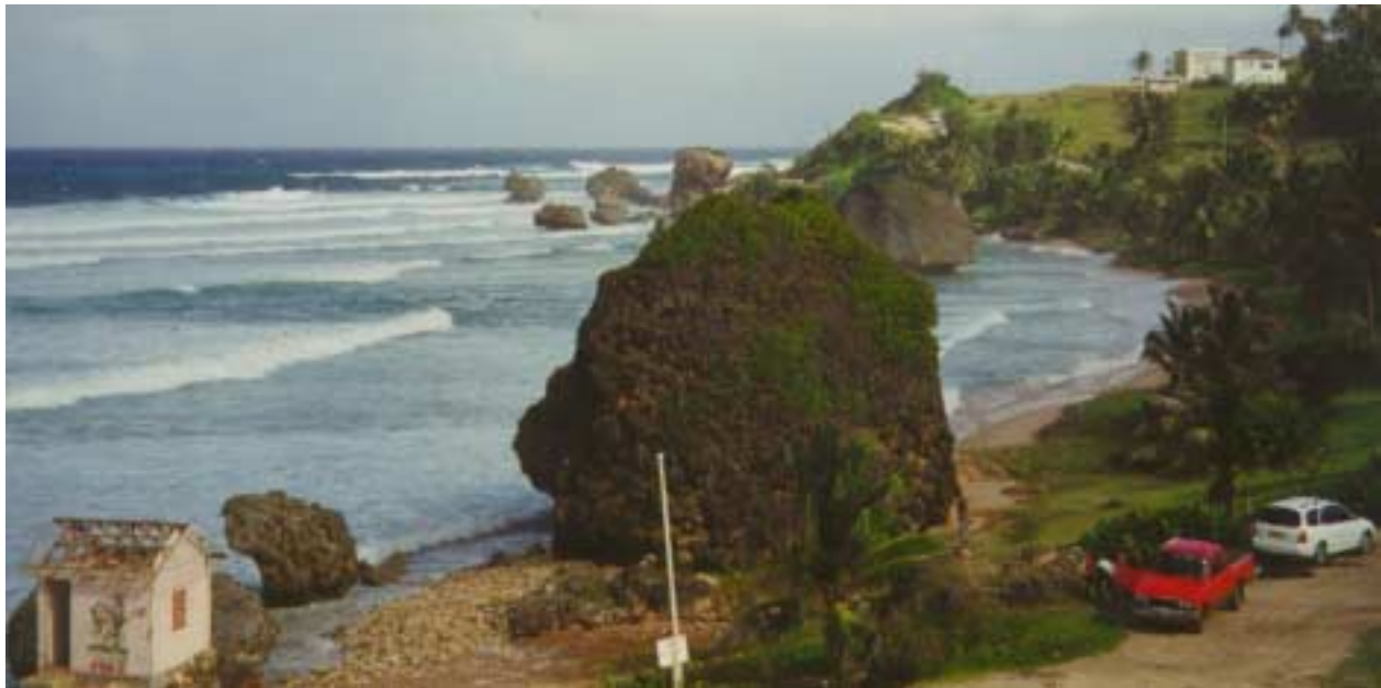
Plate: 10 A tidepool site at Bathsheba, East Coast