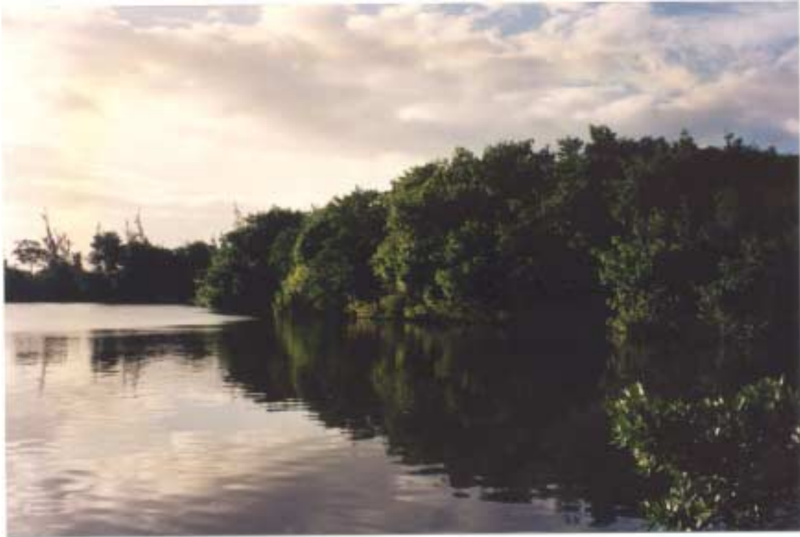
Plate: 2 The Graeme Hall Swamp