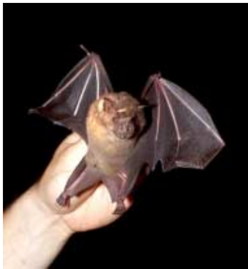
Plate: 6 A bat found in the Jack in the Box Gully, St Thomas

A general lack of knowledge about the ecology of the bats of Barbados makes it difficult to assess additional threats to populations or habitats. One or possibly two of the bats of Barbados are endemic sub-species. They are therefore unique to Barbados and of significant scientific, educational and intrinsic value.