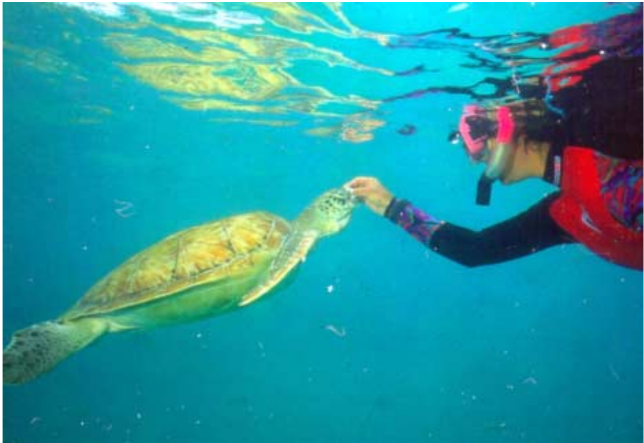
Plate: 8 A green turtle ( Chelonia mydas ) being fed by a diver

The three primary problems, apart from predation, facing nesting hawksbills and leatherback turtles on the east coast are sand mining, vehicular use of beaches, and oil/solid waste pollution of beaches. Sand mining, particularly in the Green Pond/ area, has the potential to destroy nesting habitat for leatherback turtles. Use of 4-wheel drive vehicles on the beach damages beach vegetation and crushes turtle nests, and tyre ruts prevent hatchlings from reaching the sea. Solid waste on beaches can impede the access of females to nesting sites and, once buried, can prevent hatchlings from emerging from nests. Chronic tar pollution may contaminate beaches and interfere with incubation (Horrocks 1997a). Coral reefs and seagrass beds are negatively affected by components of land run off such as high sediment load and sewage pollution, as well as poor boat anchoring practices and over-fishing.